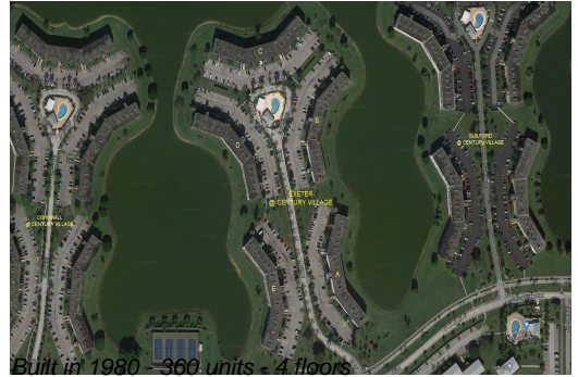
Built in 1980 - 360 units - 4 floors