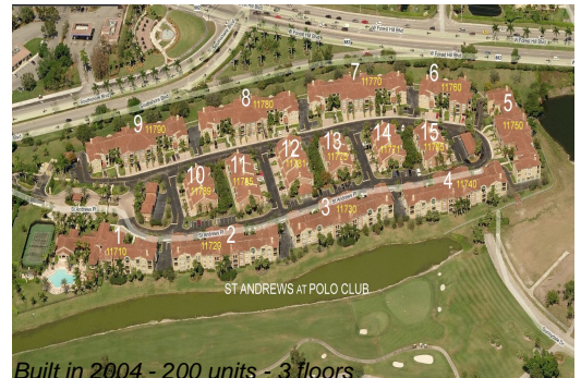
Built in 2004 - 200 units - 3 floors