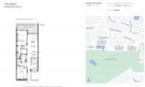
Built in 1980 - 168 units - 7 floors

6320 Boca del Mar Dr # 105 - 6320 Boca del Mar Dr, Boca Raton, FL, Palm Beach 33433