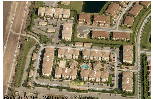
Built in 2005 - 240 units - 3 floors