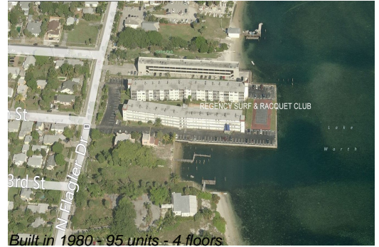
Built in 1980 = 95 units - 4 floors