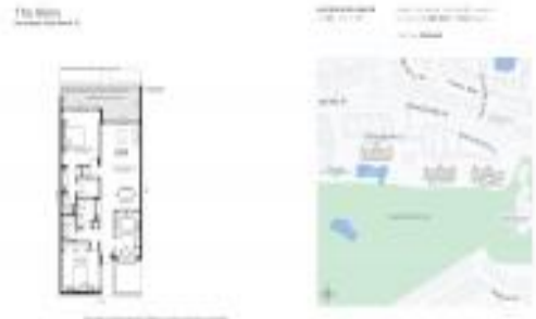
Built in 1980 - 168 units - 7 floors

6420 Boca del Mar Dr # 302 - 6320 Boca del Mar Dr, Boca Raton, FL, Palm Beach 33433