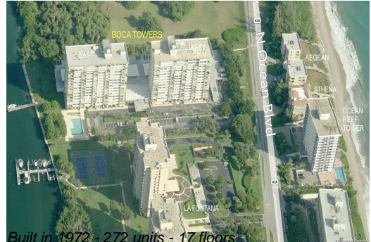
Built in 1972 - 272 units - 17 floors