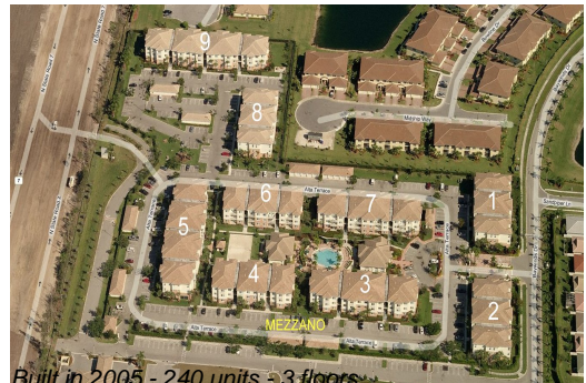
Built in 2005 - 240 units - 3 floors