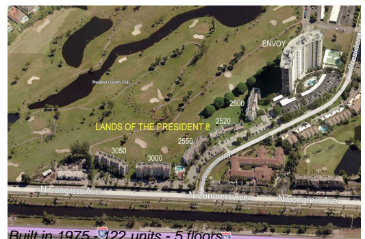
Built in 1975 - 122 units - 5 floors

Lands of the President 8: 2% West Palm Beach: 4% Palm Beach: 4%