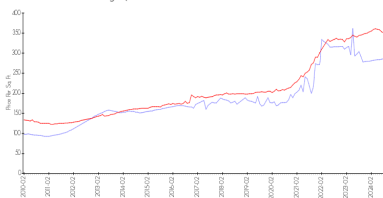
Residences at Legacy Place vs Palm Beach Gardens