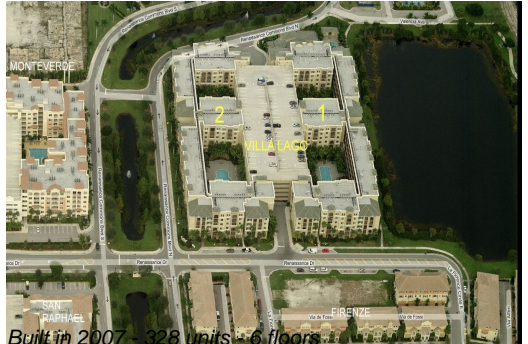
Built in 2007 - 328 units - 6 floors