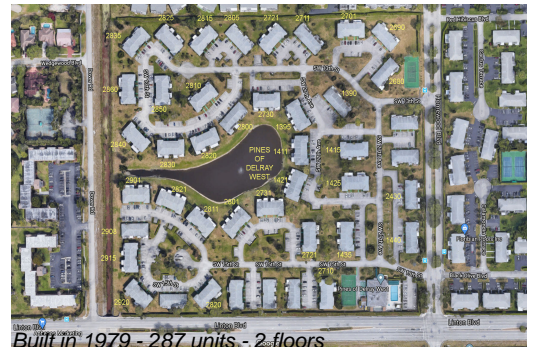
Built in 1979 - 287 units - 2 floors