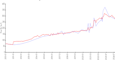
Arissa Place vs Wellington