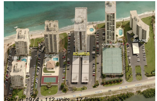
Built in 1974 - 112 units - 17 floors