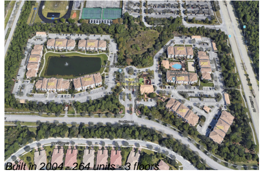
Built in 2004 - 264 units - 3 floors