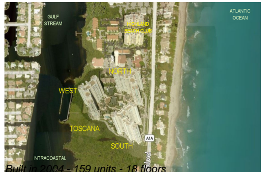
Building 608 - 159 units - 18 floors