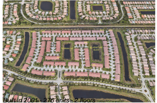
Built in 2001 - 276 units - 2 floors