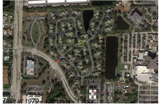
Built in 1979 - 136 units - 1 floor