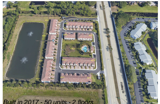
Built in 2017 - 50 units - 2 floors