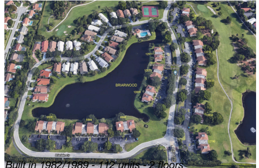
Built in 1982/1989 - 112 units - 2 floors