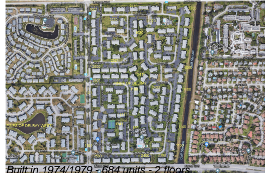
Built in 1974/1979 - 684 units - 2 floors