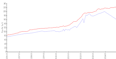
Shoma Townhomes at Royal Palm vs Royal Palm Beach