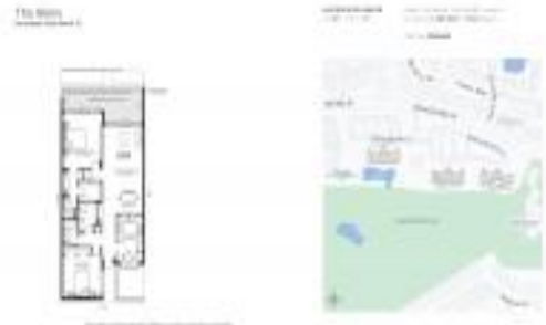
Built in 1980 - 168 units - 7 floors

6420 Boca del Mar Dr # 207 - 6320 Boca del Mar Dr, Boca Raton, FL, Palm Beach 33433