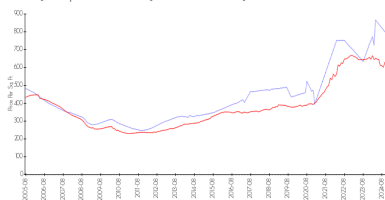
Juno by the Sea North - Juno Beach Tower vs Juno Beach