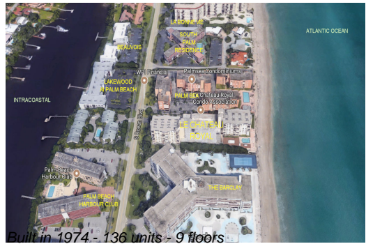
Built in 1974 - 136 units - 9 floors