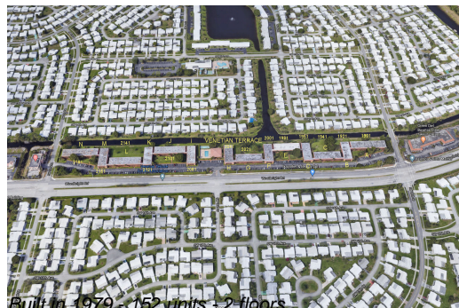
Built in 1979 - 152 units - 2 floors