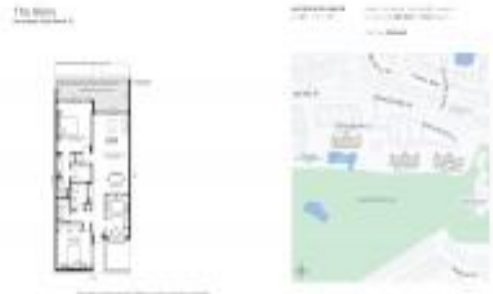
Built in 1980 - 168 units - 7 floors

6620 Boca del Mar Dr # 407 - 6320 Boca del Mar Dr, Boca Raton, FL, Palm Beach 33433