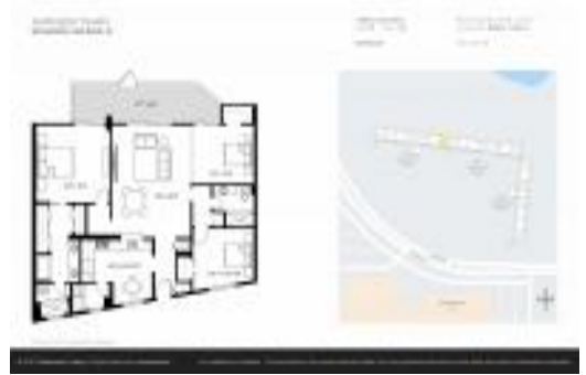
Built in 1989 - 168 units - 8 floors

The above valuated price is a baseline figure that does not take into account any specific renovation, upgrade, split, merge, or deterioration of the unit.