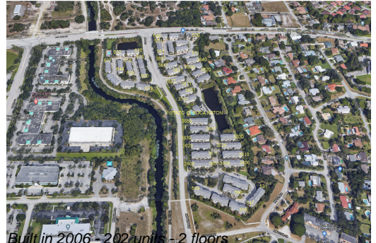
Built in 2006 - 202 units - 2 floors