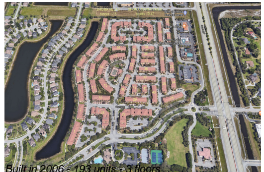
Built in 2006 - 193 units - 3 floors