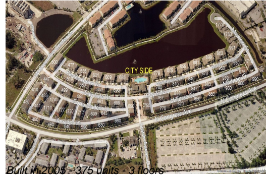
Built in 2005 - 375 units - 3 floors

The above valuated price is a baseline figure that does not take into account any specific renovation, upgrade, split, merge, or deterioration of the unit.