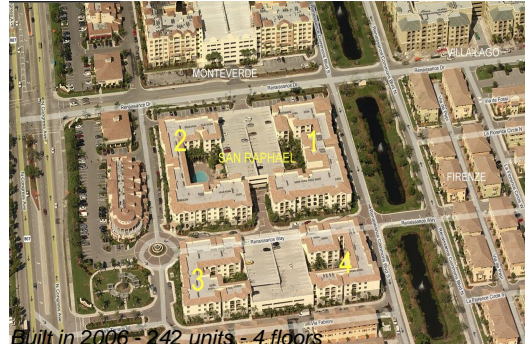
Built in 2006 - 242 units - 4 floors