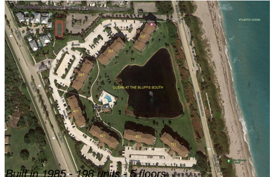
Built in 1985 - 198 units - 6 floors