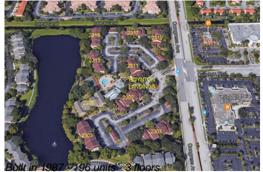
Built in 1987 - 196 units - 3 floors