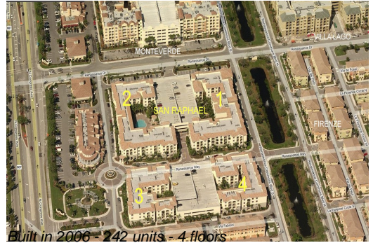
Built in 2006 - 242 units - 4 floors