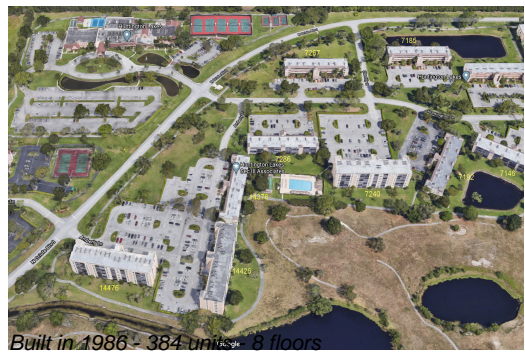
Built in 1986 - 384 units - 8 floors