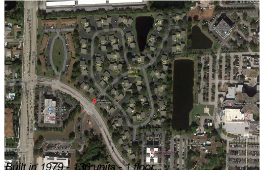
Built in 1979 - 136 units - 1 floor