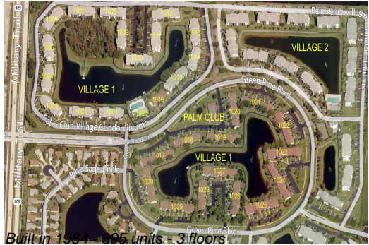
Built in 1984 - 395 units - 3 floors