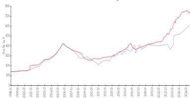
Ambassador's One South (South Tower) vs Highland Beach