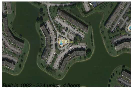
Built in: 1982 - 224 units - 4 floors