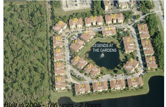
Built in 2005 - 186 units - 2 floors