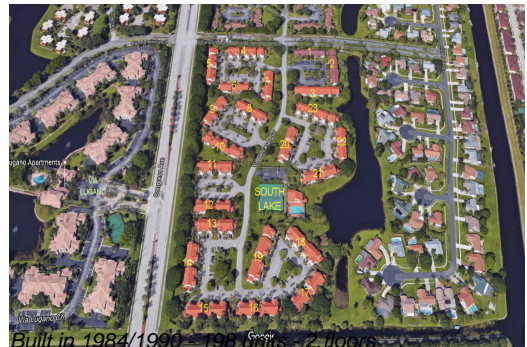
Built in 1984/1990 - 190 Units - 2 floors