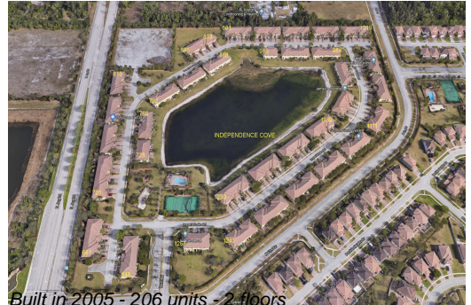
Built in 2005 - 206 units - 2 floors