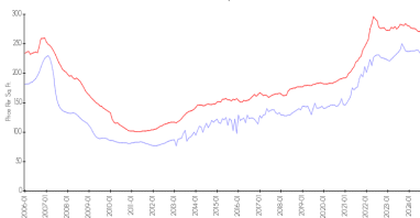
Firenze at Renaissance Commons vs Boynton Beach