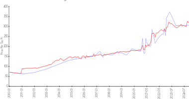
Arissa Place vs Wellington