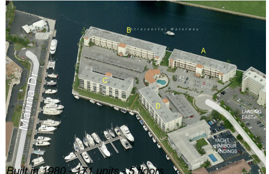
Built in 1980 - 171 units - 5 floors