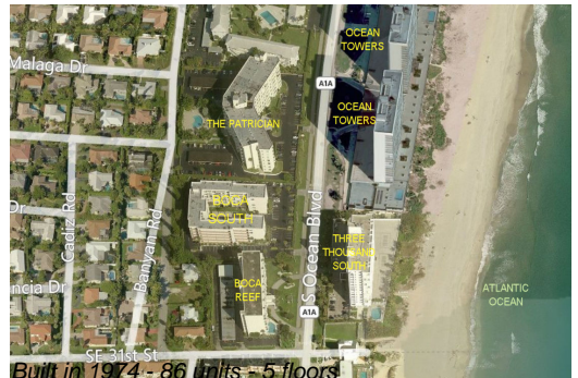
Built in 1974 - 86 units - 5 floors