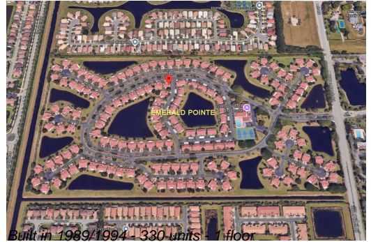
Built in 1989/1994 - 330 units - 1 floor