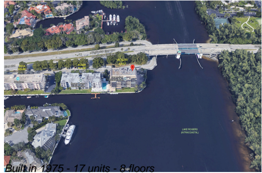
Built in 1975 - 17 units - 8 th floors