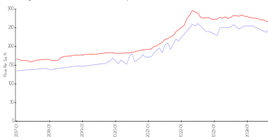
Quantum Park: Townhomes vs Boynton Beach